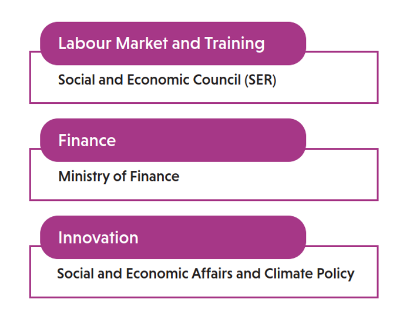
Figure 2 Cross-sectoral executive committees and the councils or ministries responsible for them.